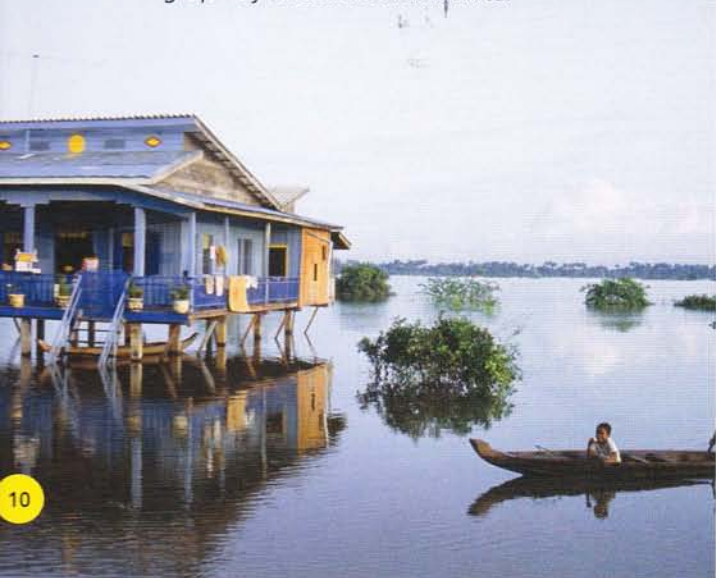
A wooden house on stilts after floods in the Mekong River in southern Cambodia