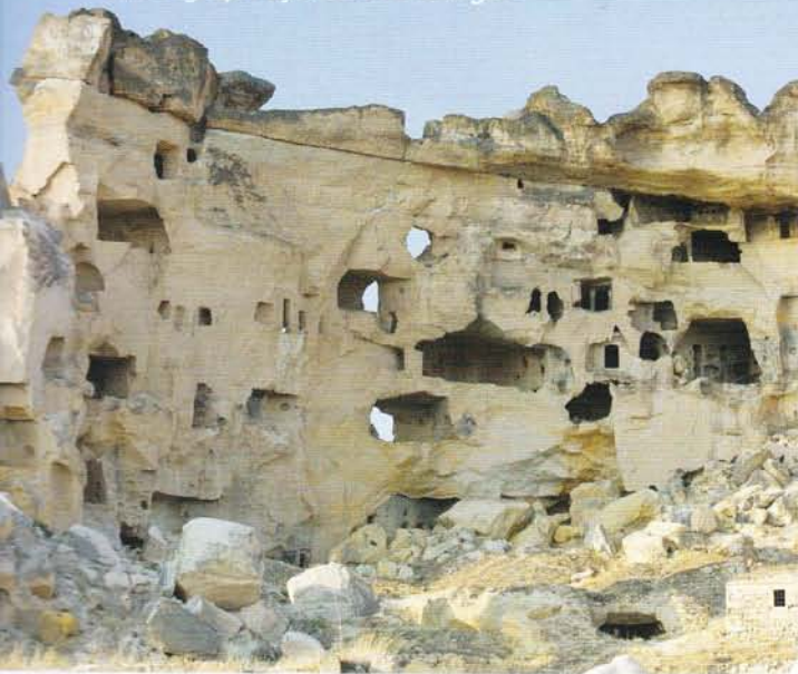
The remains of homes carved into rock in Cappadocia, Turkey